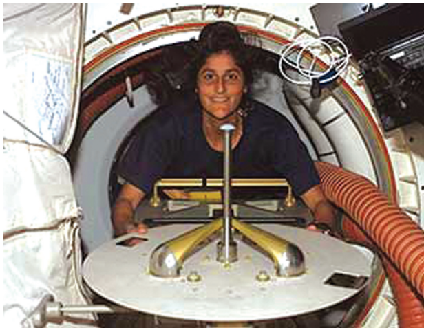
Sunita Williams coming out of spaceship

As Sunita Williams ended her space journey in United States, her relatives back home in Gujarat could not stop their tears of joy. 'She has landed safely by the grace of God. It is a moment of great joy for all of us,' said Sunita's uncle. Her relatives came out on the streets and danced till daybreak, bursting crackers and beating drums!