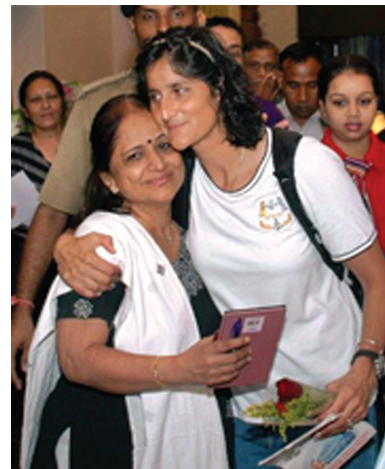
Sunita Williams with her relatives