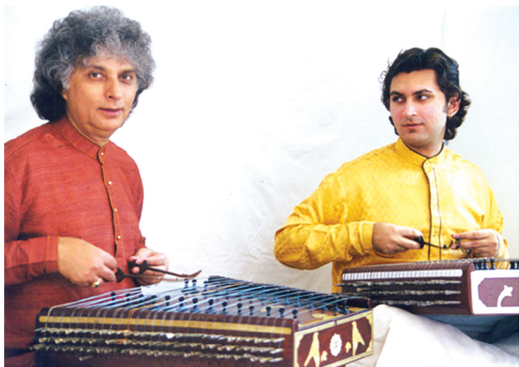
Pt. Shiv Kumar Sharma and his son Rahul Sharma

In some families, the food habits or style of dressing of some of the members are similar. Some members of a family may not like some dish or the whole family may be fond of kheer (rice pudding). In the same manner, many children follow the occupations of their parents or relatives like the son/daughter of a sports person wants to follow the same sport. The children of singers, artists, actors, builders, goldsmiths or doctors may follow the footsteps of their parents or they may want to take up some other work.